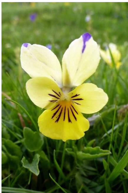
Viola lutea (MountainPansy)