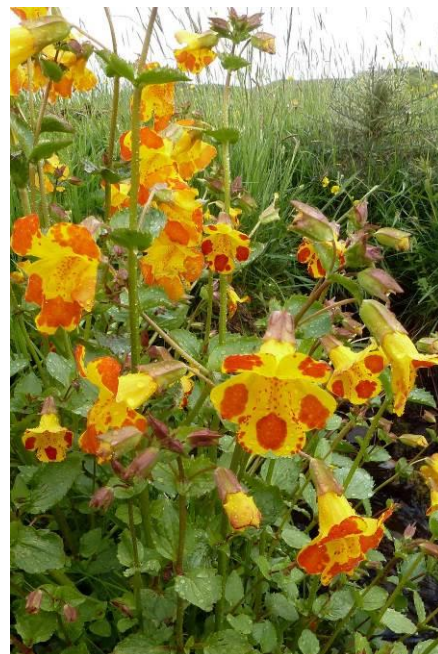
Mimulus x robertsii (Hybrid Monkeyflower)