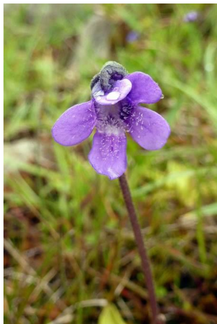
Pinguicula vulgaris (Butterwort)