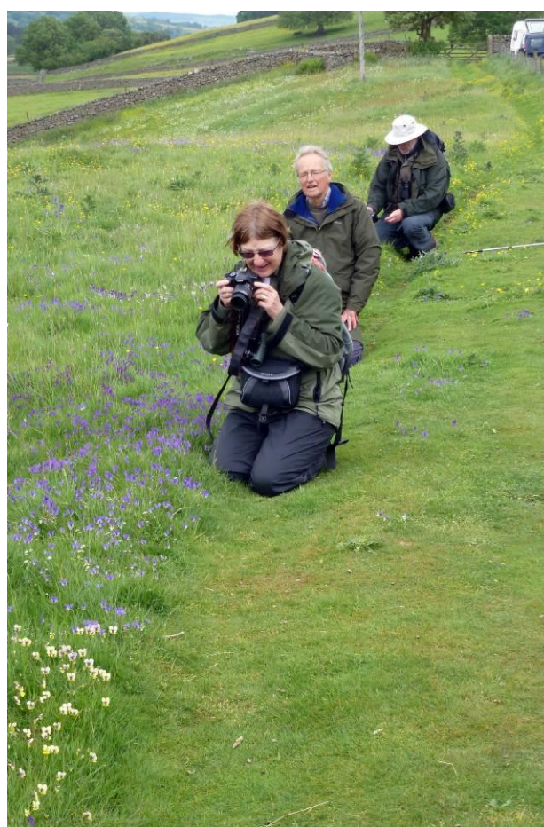
Clients among the Viola lutea (Mountain Pansies)