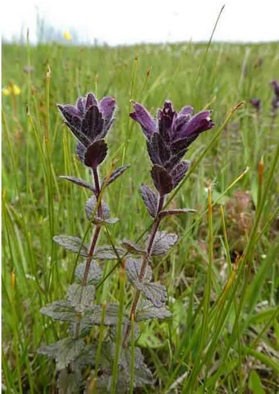
Alpine Bartsia ( Bartsia alpina )