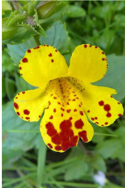
Hybrid Monkeyflower ( Mimulus x robertsii )