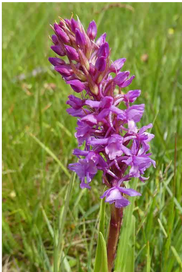
Chalk Fragrant Orchid ( Gymnadenia conopsea )

Setting up a personal profile at www.facebook.com is quick, free and easy. The Naturetrek Facebook page is now live; do please pay us a visit!