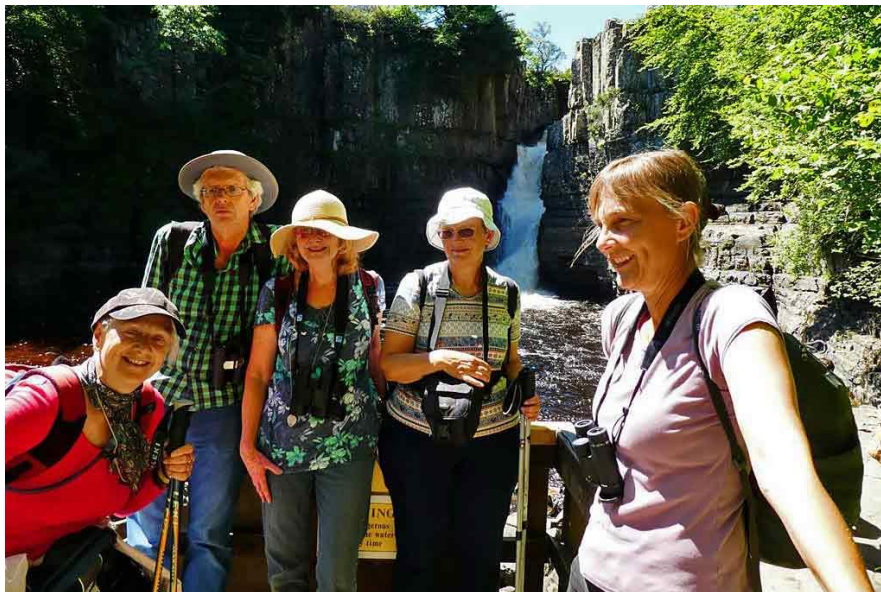
Group at High Force