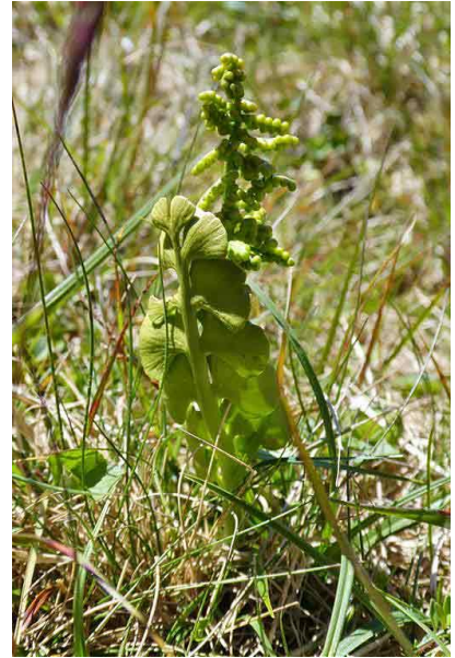
Moonwort ( Botrychium lunaria )