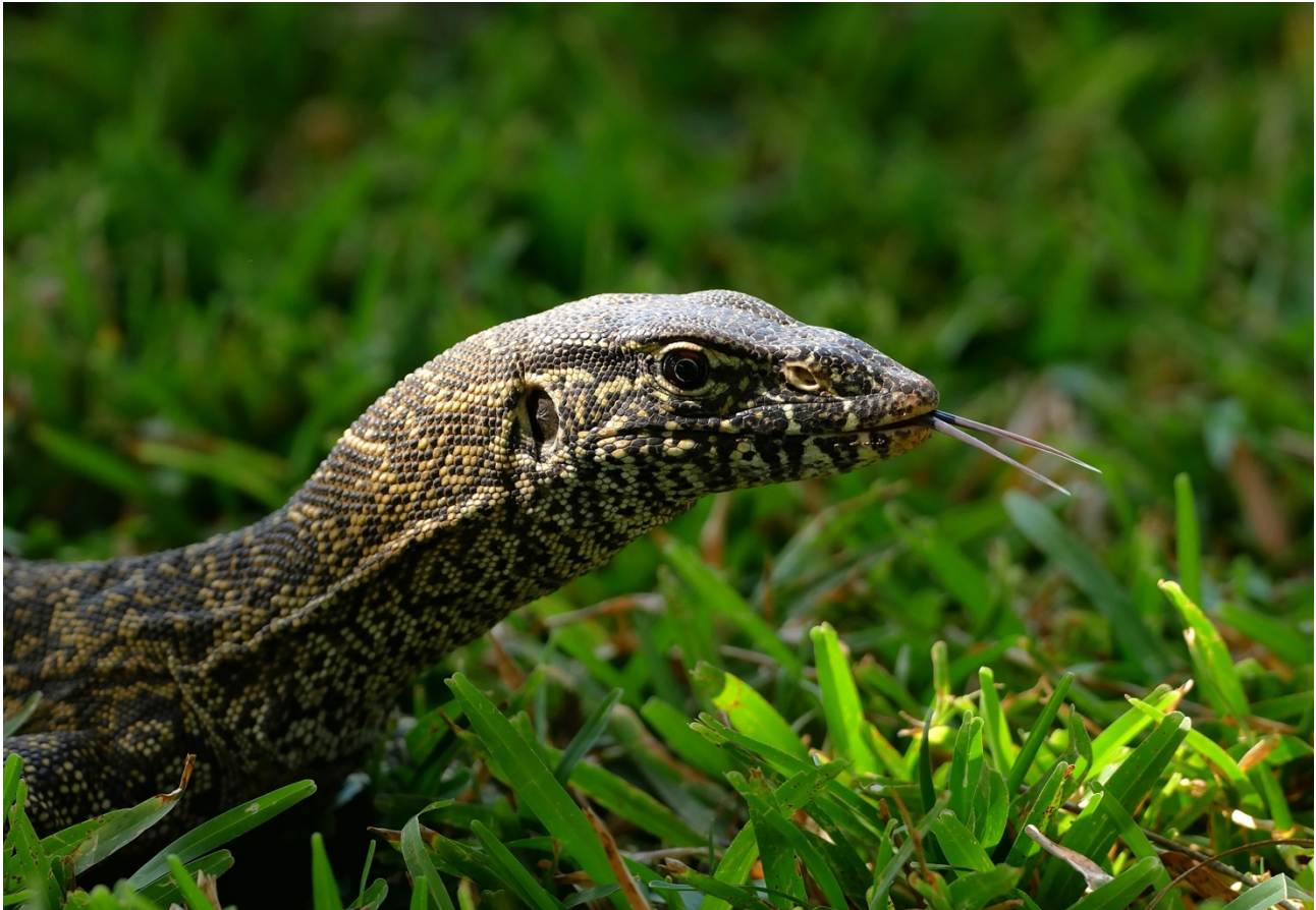
Nile Monitor Lizard by Connell

Back at our rooms we still had plenty of time to freshen up and complete our packing before we relaxed while we waited for our bus transfer back to the airport, and for some of the group, our homeward flight. Several members had arranged further extensions in Gambia and were swapped from one bus to another for their hotel transfers.