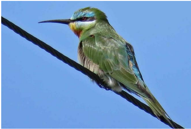
Blue-cheeked Bee-eater