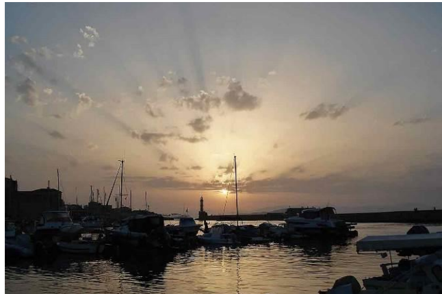
Sunset over Chania