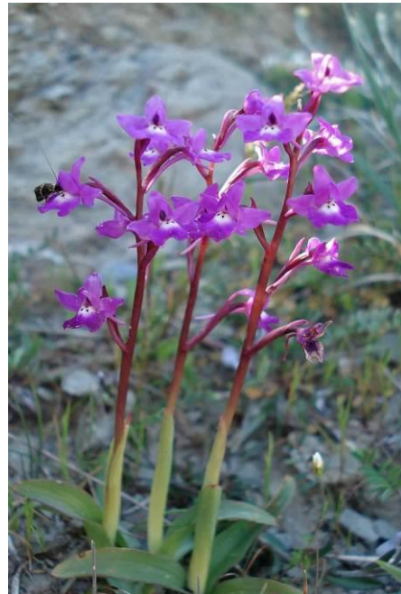
Four-spotted Orchid