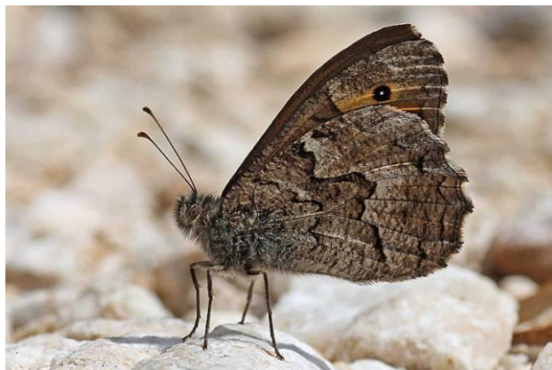
Samos Grayling ( Hipparchia mersina)