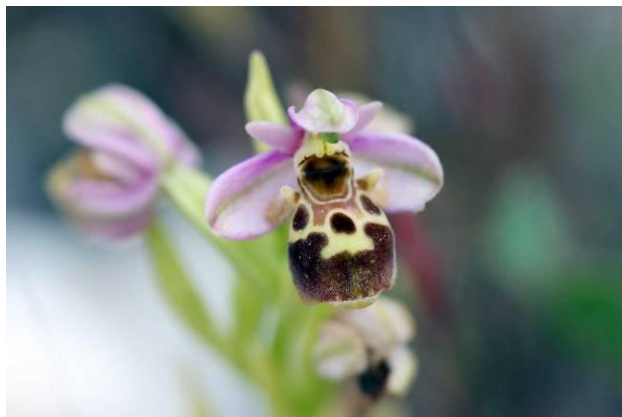
Ophrys minutula (a Woodcock Orchid) - Sheila Palmer