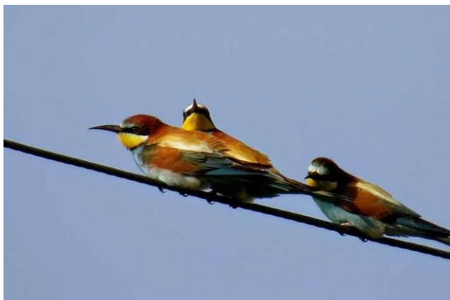
European Bee-eaters