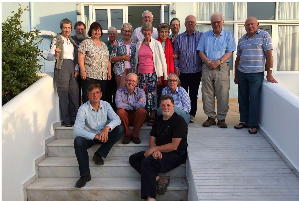
The 2014 Naturetrek Samos Group