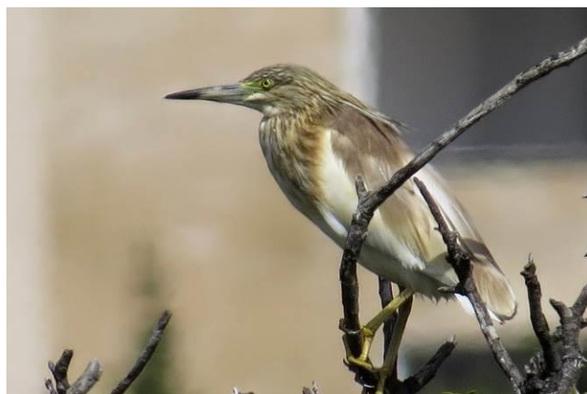
Squacco Heron