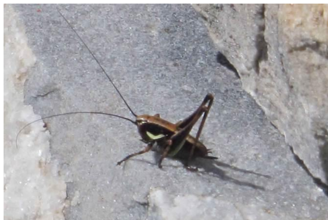
Roesel's Bush-cricket