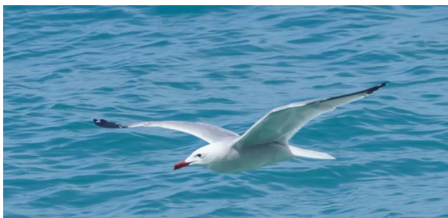
Audouin's Gull by Bill Gray

Setting up a personal profile at www.facebook.com is quick, free and easy. The Naturetrek Facebook page is now live; do please pay us a visit!