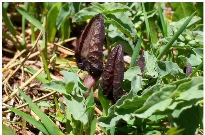
Aristolochia incisae