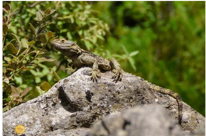
Starred Agama