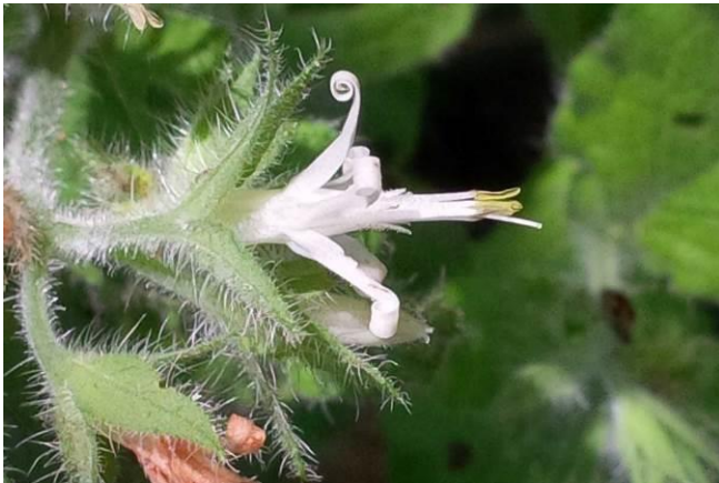
Procopiana cretica