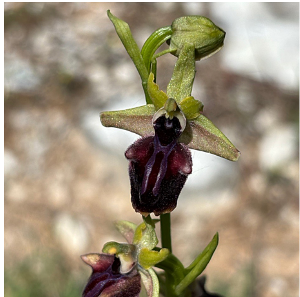
Ophrys sphegodes subsp. mammosa