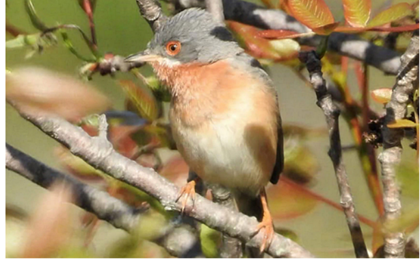
Eastern Subalpine Warbler