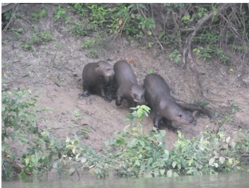
Giant River Otter

Karanambu Lodge to Cara Lodge, Georgetown