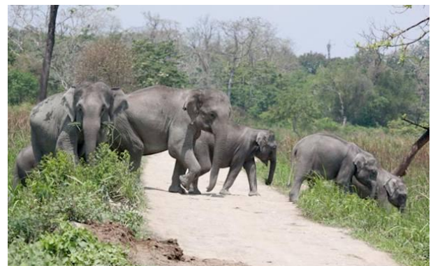
Asian Elephant herd