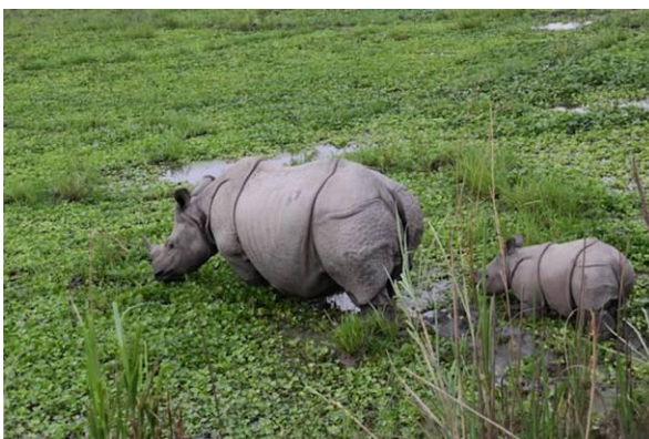
Greater One-horned Rhinos