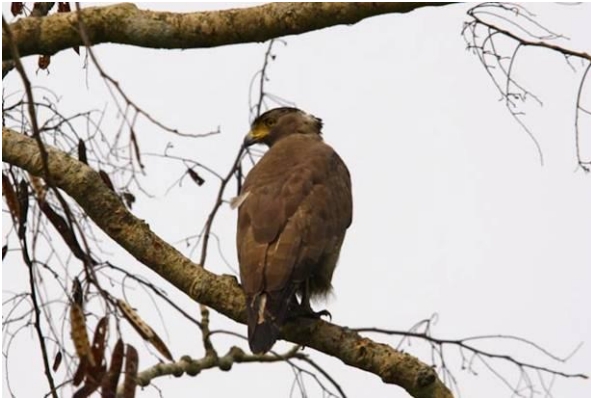
Crested Serpent Eagle