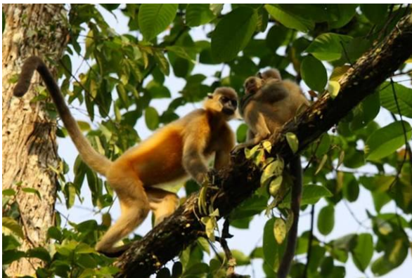
Golden Langur Monkeys