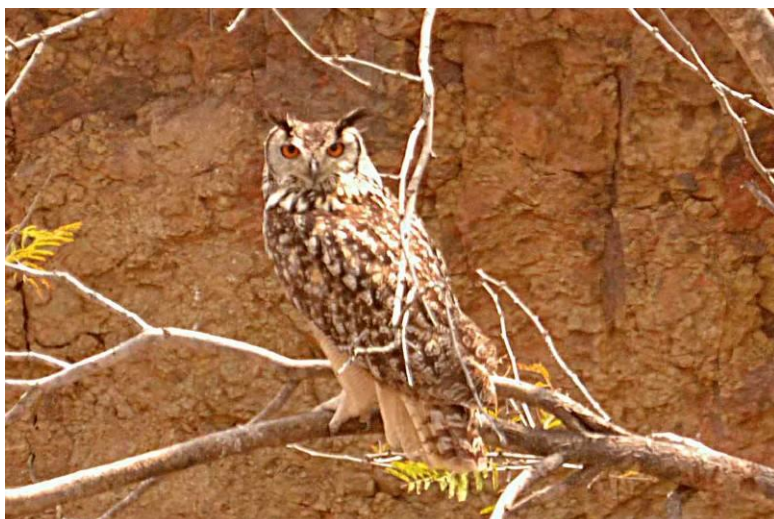
Eurasian Eagle Owl

Setting up a personal profile at www.facebook.com is quick, free and easy. The Naturetrek Facebook page is now live; do please pay us a visit!