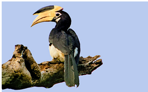
Malabar Pied Hornbill

For our afternoon birding, we visited the famous thirteenth-century Mahadeva Temple and its surroundings at Tambdi Surla. We added a few more specialities to the list at this site, returning to the camp by 6.15pm.