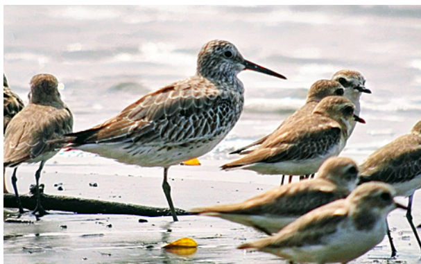
Great Knot and Tibetan Sand Plovers

Today being the day for check out from Mandrem Beach Resort and transfer to Backwoods Camp, the clients requested a relaxed morning for packing, with a late pick-up. I picked them up at 10.30am and we departed for Backwoods Camp, arriving for lunch at 1.30pm.