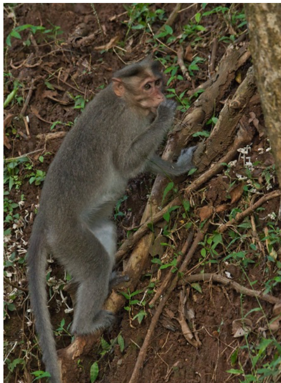
Bonnet Macaque feeding on mushrooms