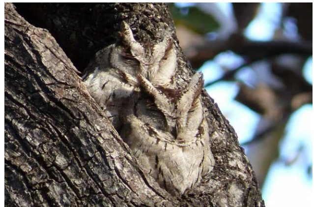
Indian Scops Owls