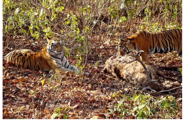
Tiger pair at kill, Pench