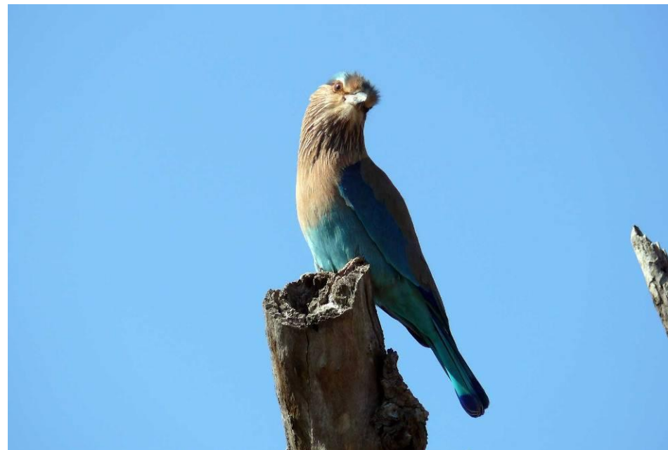
Indian Roller