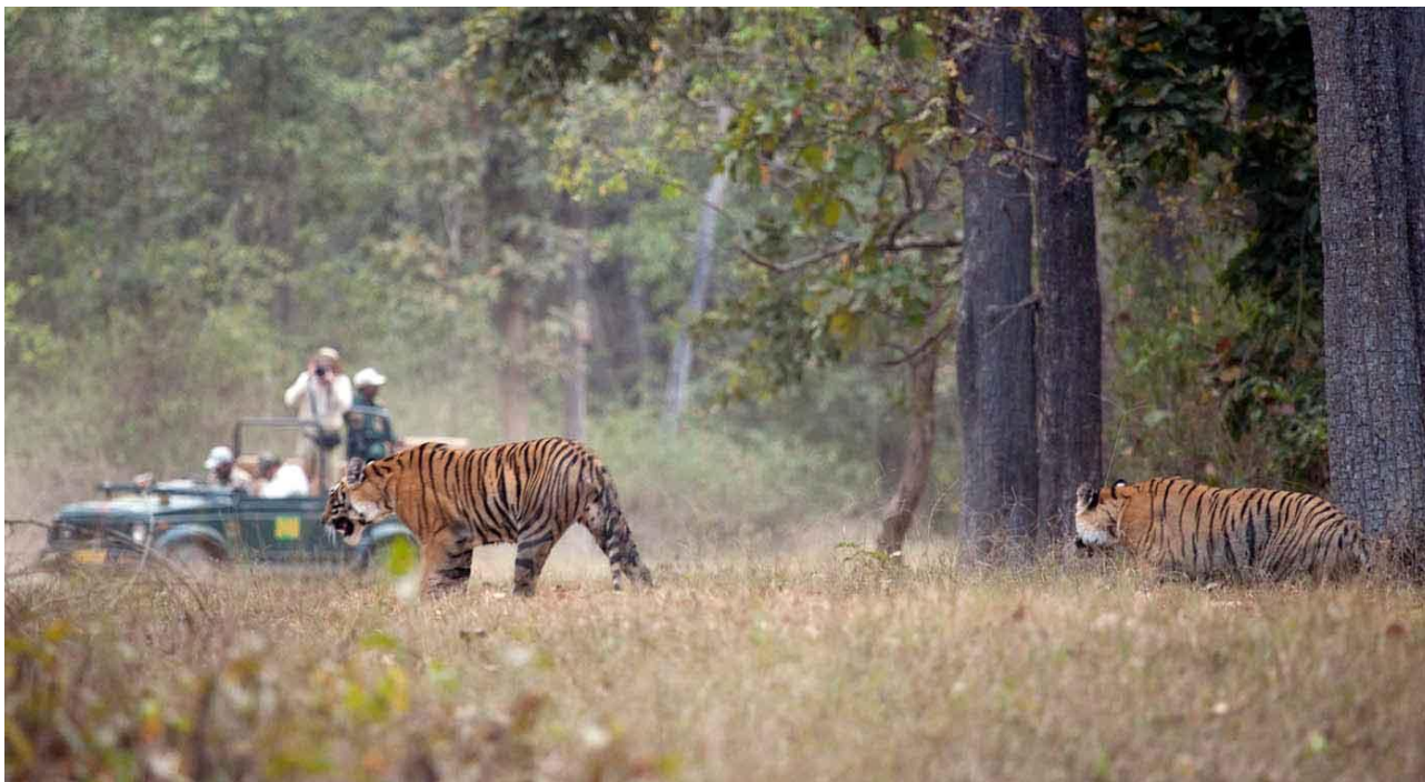
Kanha

Setting up a personal profile at www.facebook.com is quick, free and easy. The Naturetrek Facebook page is now live; do please pay us a visit!