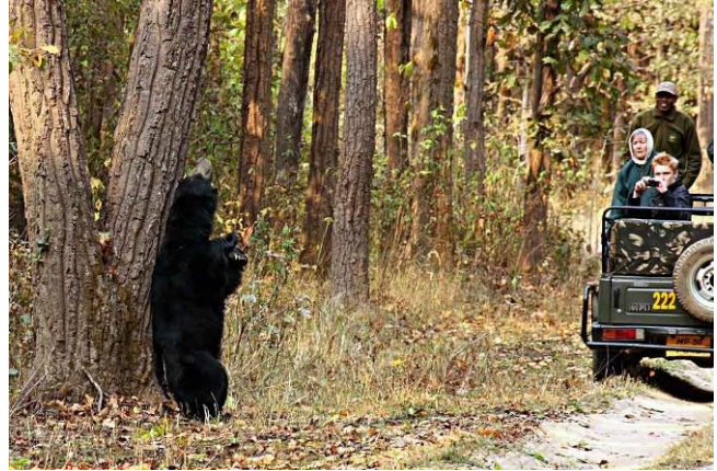
Sloth Bear