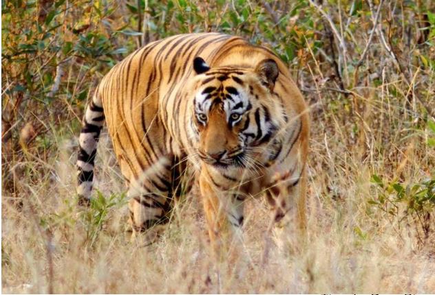
Tiger