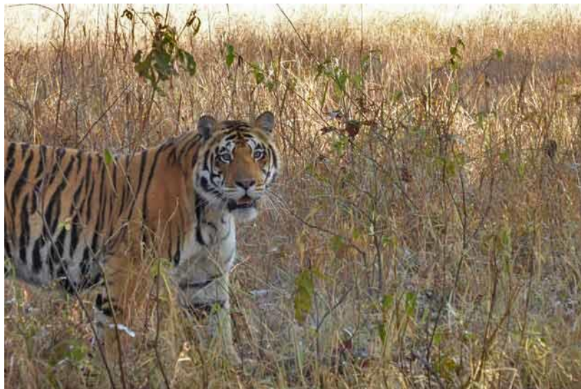
Royal Bengal Tiger