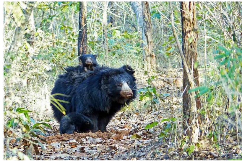
Sloth Bear & cub