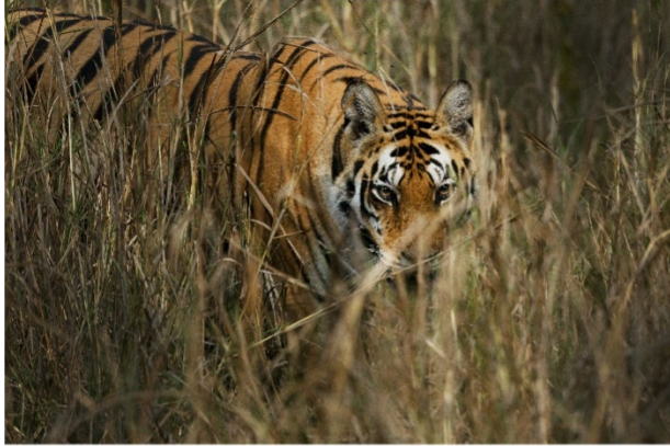
Tigress MB3 in Kanha