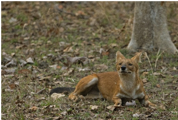
Wild Dog in Pench