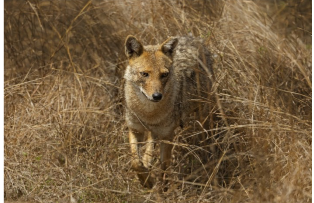
Golden Jackal in Pench