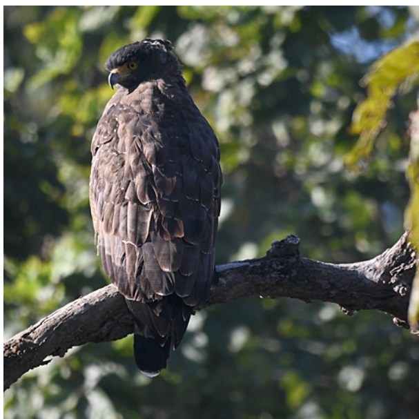
Crested Serpent Eagle

Today was our last day in Pench National Park. During the safari, we spotted a Leopard on the road, with two cubs on the other side. Shortly afterwards, the female crossed the road as well. We also came across a herd of Gaur. We observed several bird species, including Paddyfield Pipit, Red-vented Bulbul, Indian Stone-curlew and Large-billed Crow. While continuing our search for other wildlife, we also sighted a Golden Jackal.