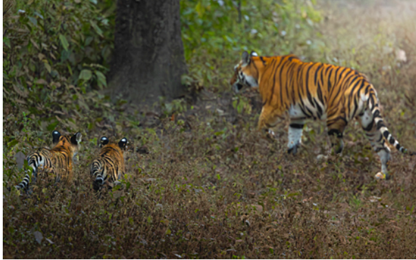
Tiger with cubs