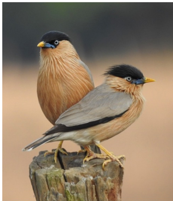
Clockwise from top left – Jungle Owlet, Painted Stork, Indian Roller, Brahminy Starlings