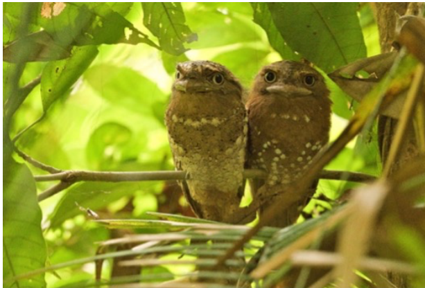
Sri Lankan Frogmouth