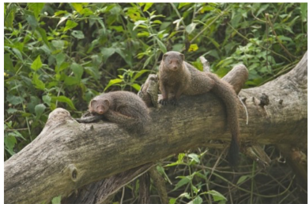
Indian Grey Mongoose