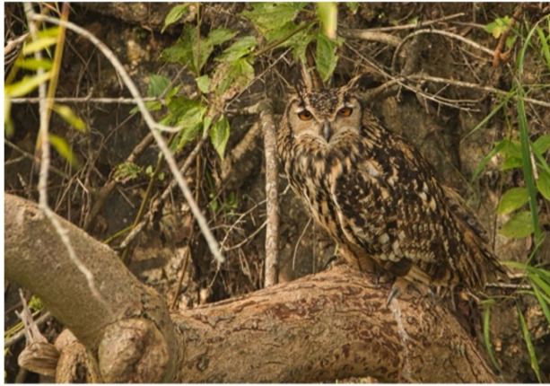
Indian Eagle Owl