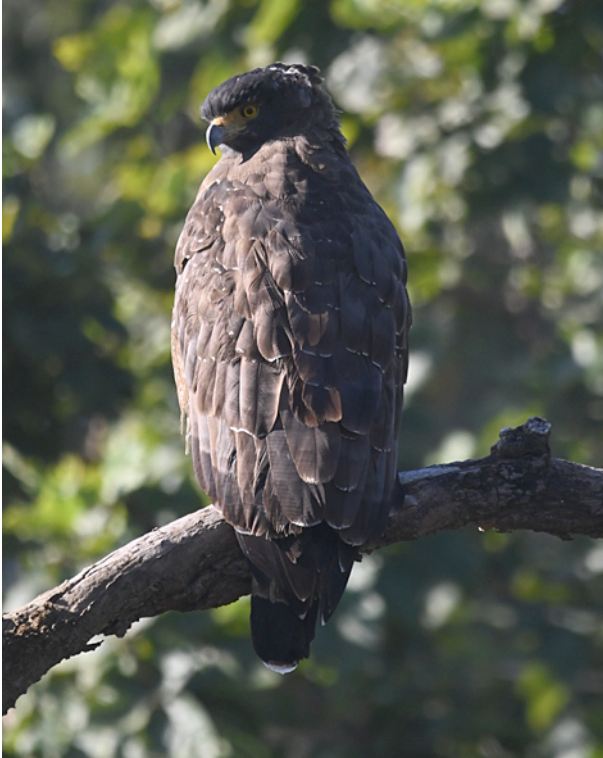
Crested Serpent Eagle