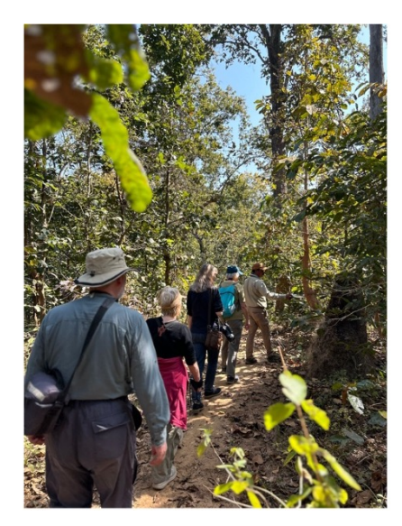
Walk around the lodge

We met again at the lodge for a checklist around 7.30pm, followed by dinner.