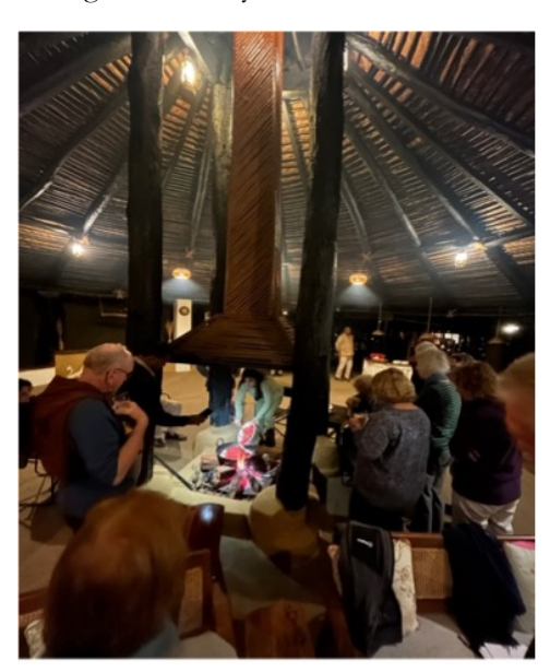
Evening inn Kanha Jungle Lodge