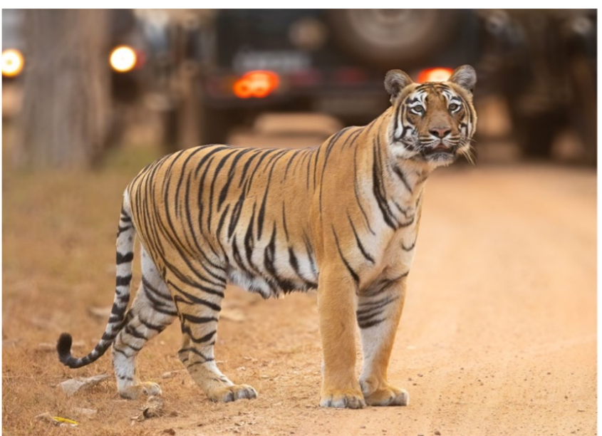
Choti tara Roma