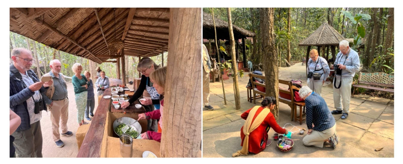
Cooking sessions Rangoli making

hospitality. Later in the evening, at 7.30pm, we reconvened for our final dinner together, sharing laughter, stories, and reflections on our time spent together before bidding farewell and embarking on our respective journeys back home.