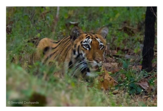
Cub of Jharni tigress

In the evening, we gathered for a round of checklists before enjoying a delicious dinner.