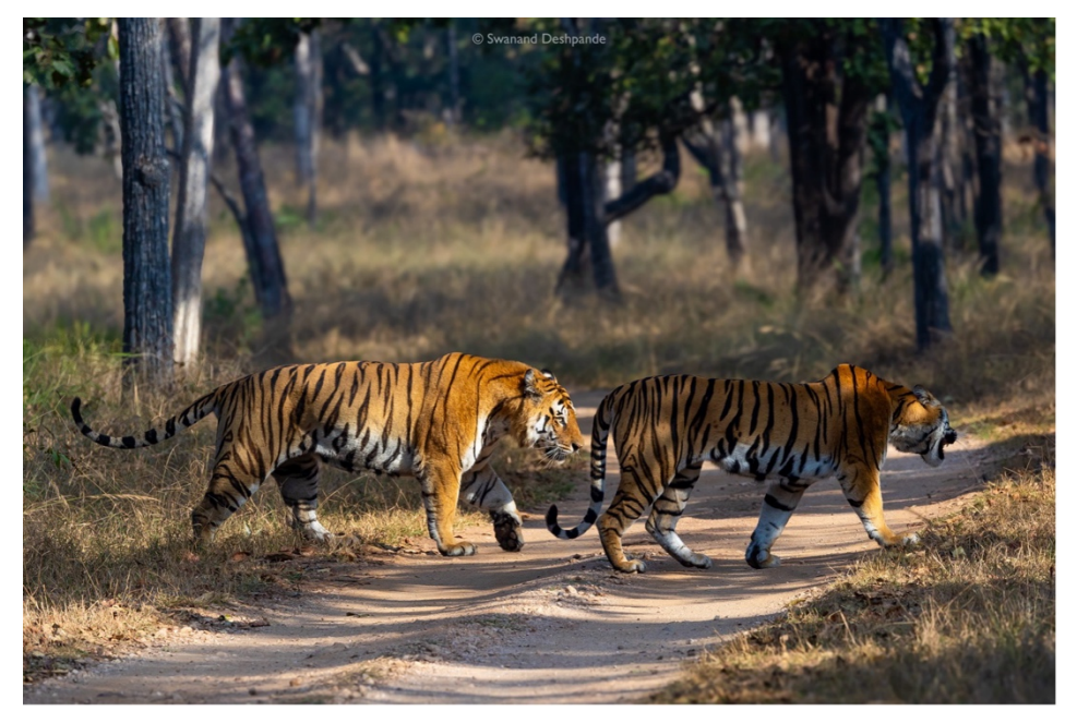
Bijamatta female and L-mark male

During the morning hours, all members of our group had the privilege of observing a pair of Tigers engaged in a slight altercation. The male Tiger was seen attempting to court the female, but she appeared uninterested in his advances. This unique encounter provided us with a fascinating opportunity to witness some of the lesser-known behaviors of these majestic creatures, offering a glimpse into their complex social dynamics and interactions. It was a captivating moment that allowed us to gain deeper insights into the intricate lives of Tigers in their natural habitat.