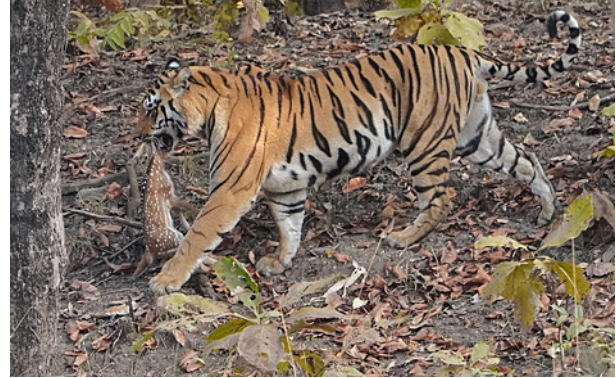
Tiger with Chital kill