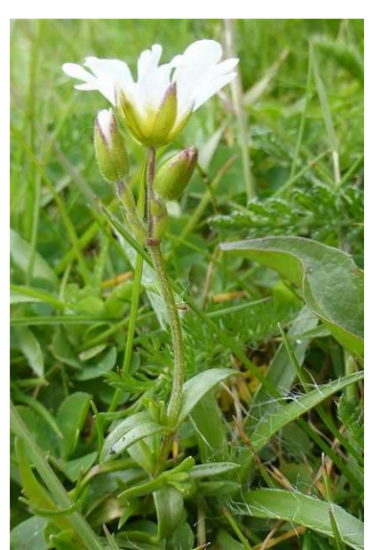
Field Mouse-ear (Cerastium arvensis)