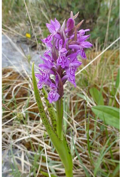
Leopard Orchid (Dactylorhiza incarnata ssp. cruenta)