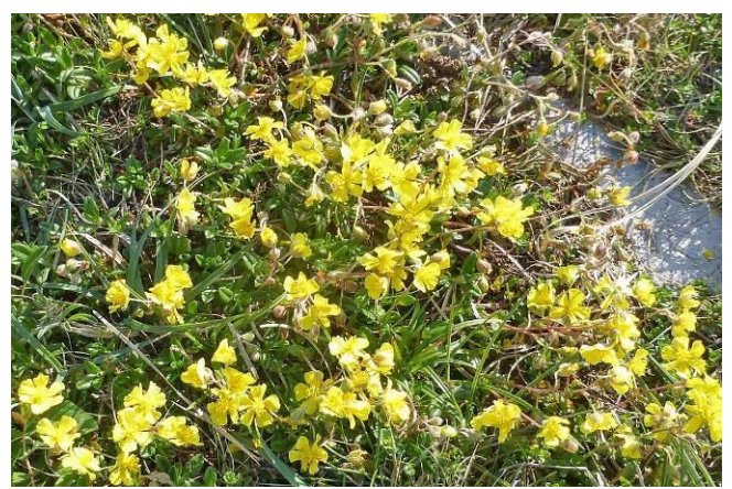
Hoary rock-rose (Helianthemum canum)