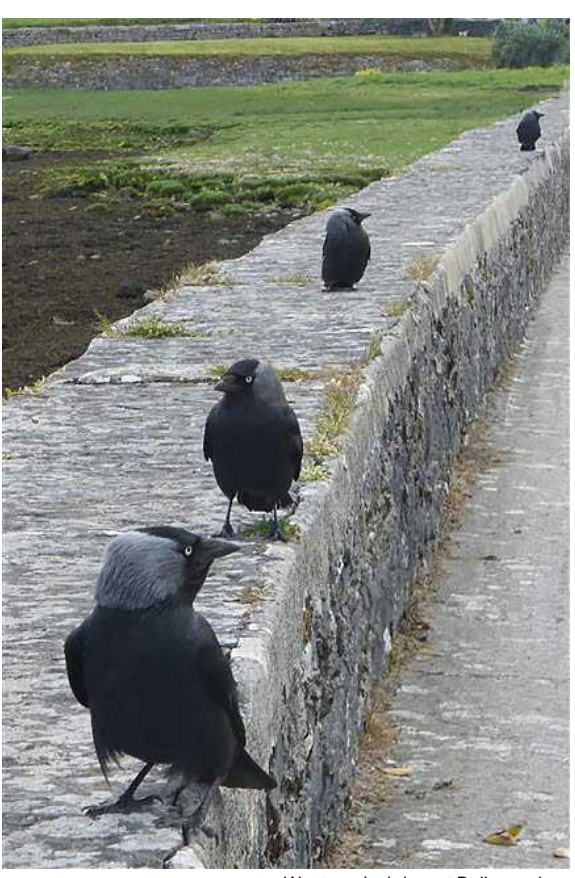
Western Jackdaw at Ballyvaughan