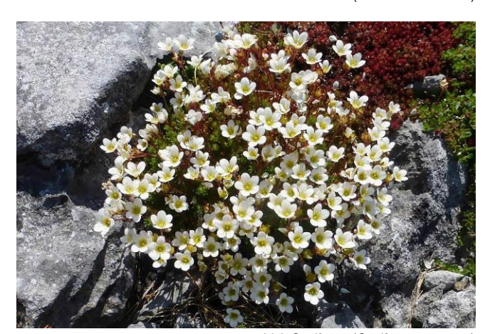
Irish Saxifrage (Saxifraga rosaceae)