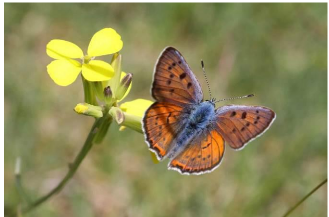
Purple-shot Copper