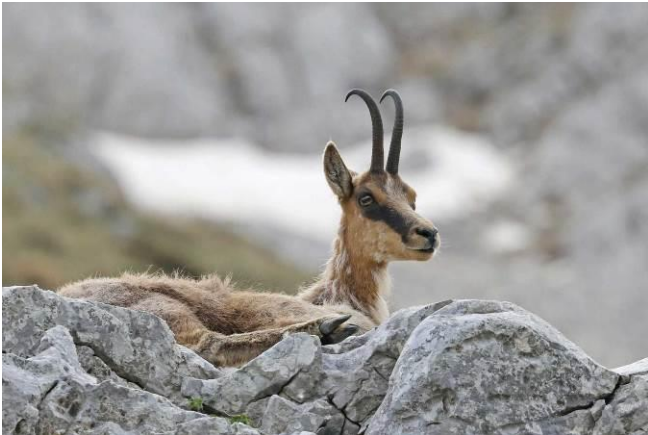
Abruzzo Chamois