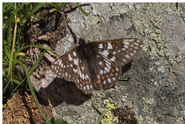
Val d'Isere-Cynthia's Fritillary