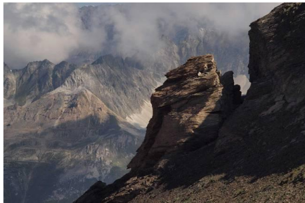
Col de L'Iseran