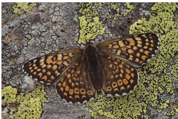
Lac du Mont Cenis-Glanville Fritillary