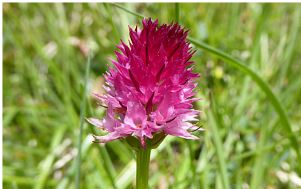
Red Vanilla Orchid