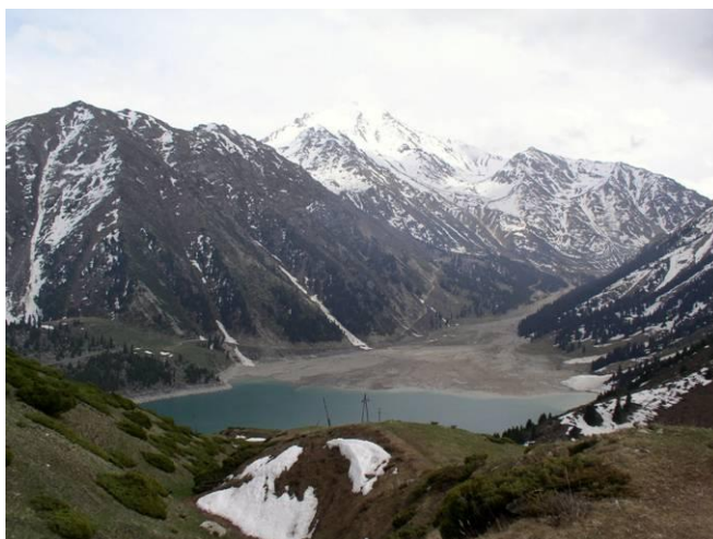
Big Almaty Lake