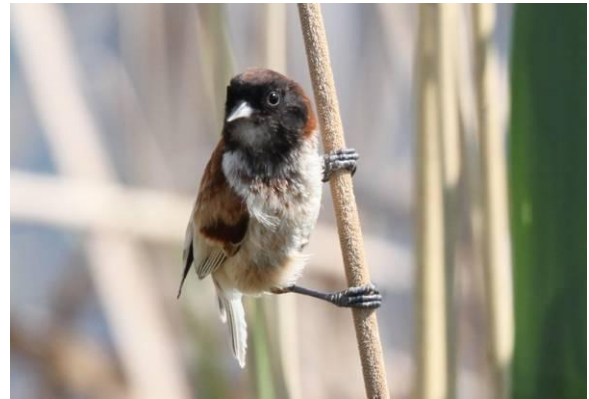
Black-headed Penduline Tit