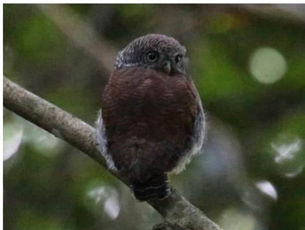
Chestnut-backed Owlet by Kevin Button