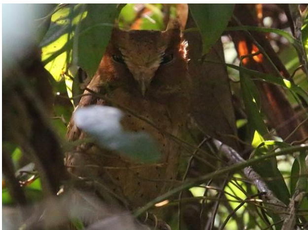
Serendib Scops Owl by Kevin Button