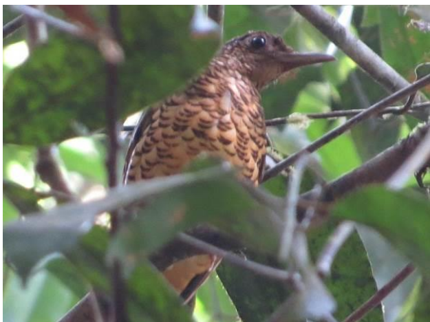
Sri Lanka Scaly Thrush