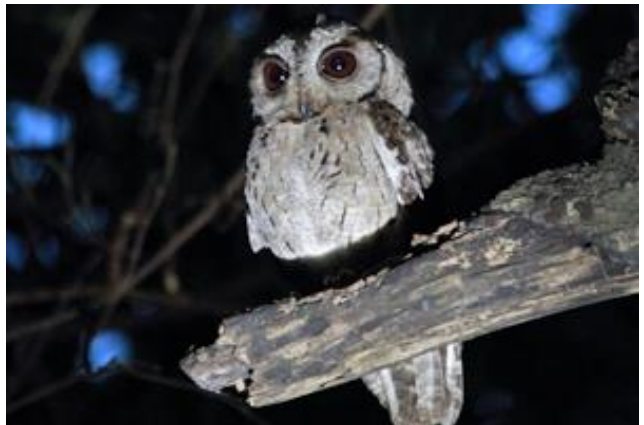
Collared Scops Owl