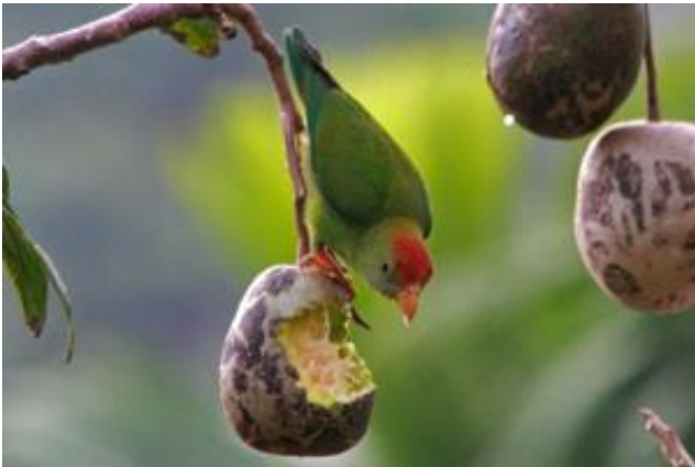
Sri Lanka Hanging Parrot