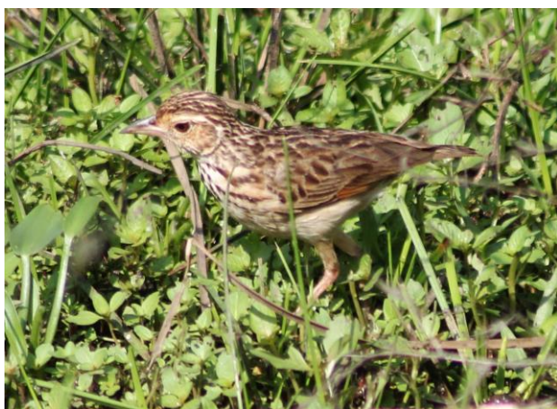
Jerdon's Bush Lark