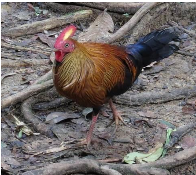
Sri Lanka Junglefowl