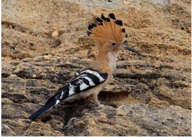
Madagascan Hoopoe