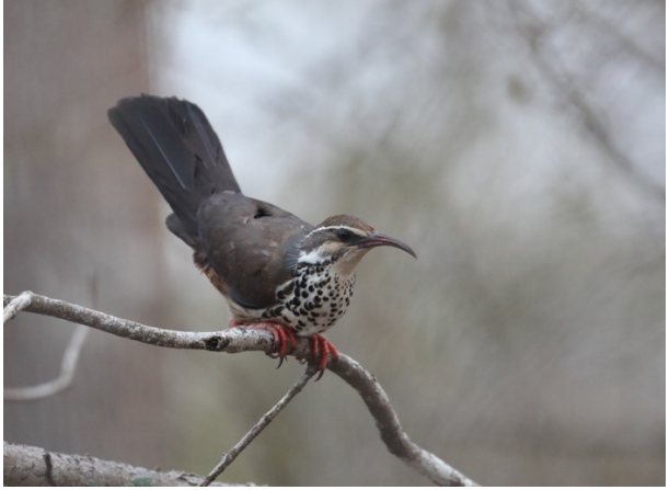
Sub-desert Mesite, Ifaty