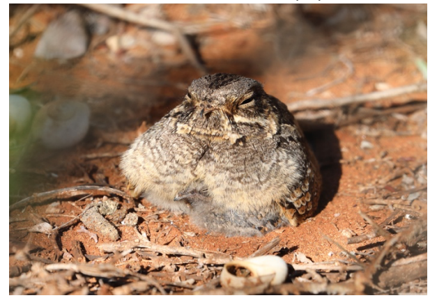
Madagascan Nightjar & chick, Berenty