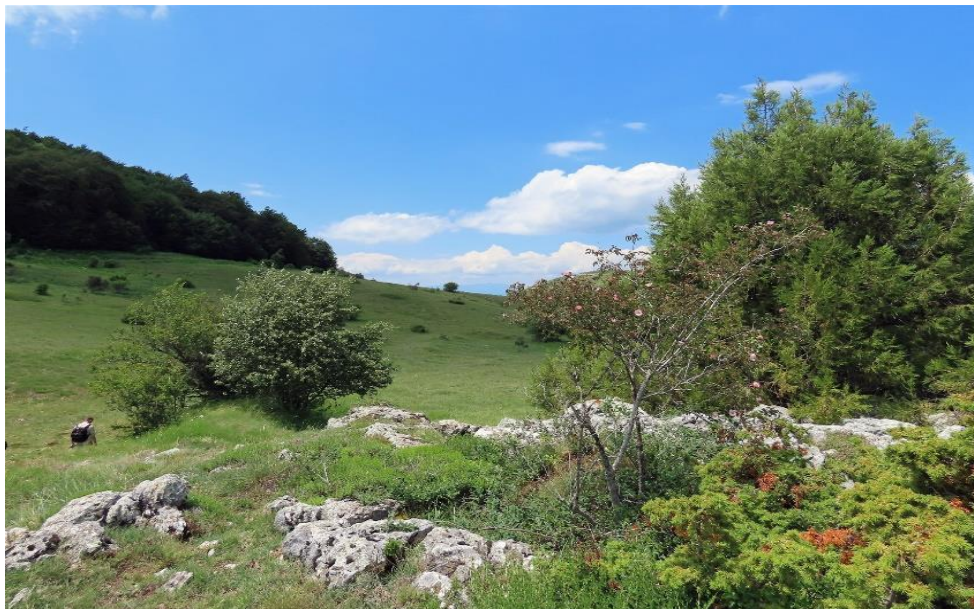
Galicica National Park

White Helleborine, Cephalanthera damasonium Pelister Crocus, Crocus pelistericus Pelister Pink, Dianthus pelistericus Macedonian Oak, Quercus trojana Macedonia Pine, Pinus peuce