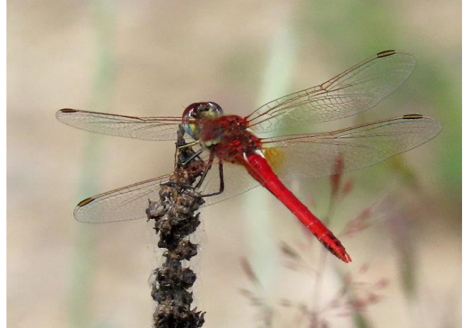
Southern White Admiral, Black-veined White, Heath Fritillary and Red-veined Darter