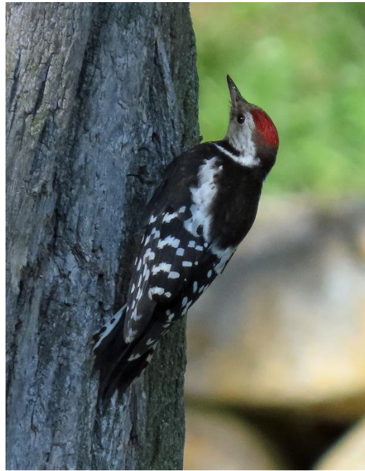
Middle Spotted Woodpecker