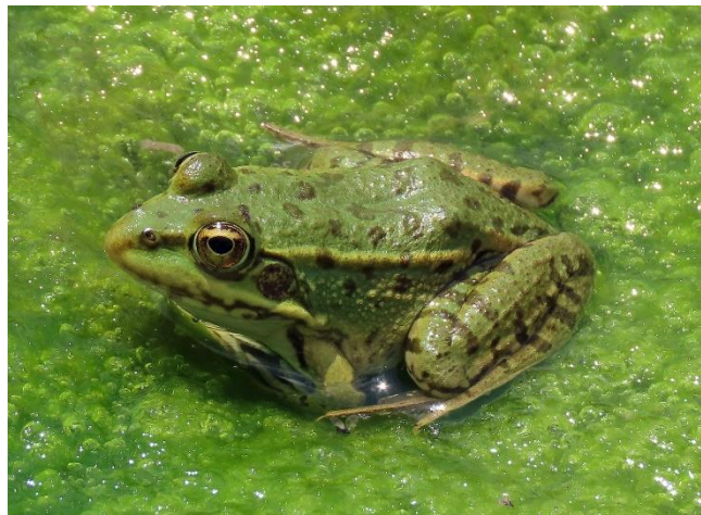
Common Marsh Frog