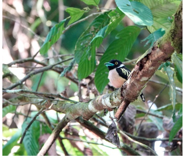
Black and Yellow Broadbill