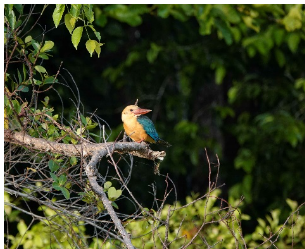
Oriental Darter (left), Stork-billed Kingfisher (right)