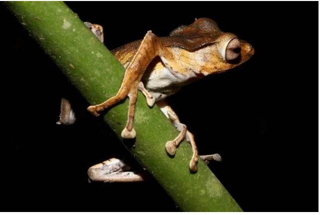
File-eared Frog - Borneo Rainforest Lodge