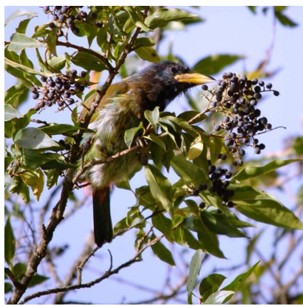
Great Barbet