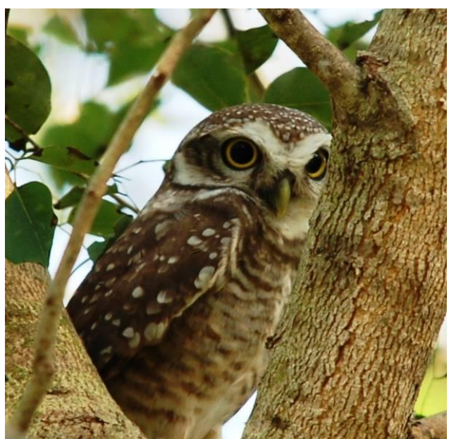
Spotted Owlet