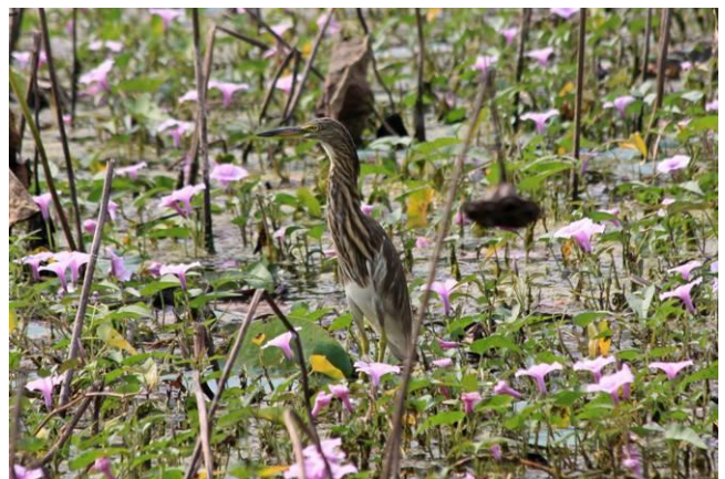
Indian Pond Heron - by Miles Charlesworth