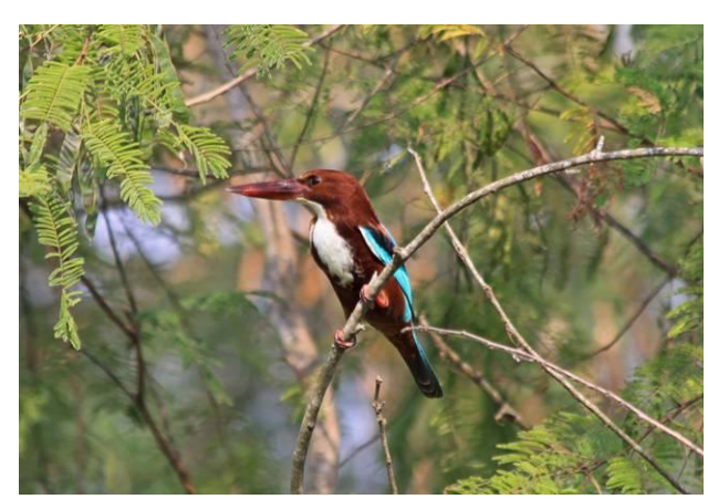
White-throated Kingfisher