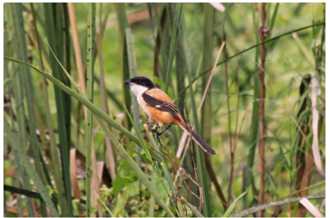
Long-tailed Shrike

Setting up a personal profile at <u>www.facebook.com</u> is quick, free and easy. The <u>Naturetrek Facebook page</u> is now live; do please pay us a visit!