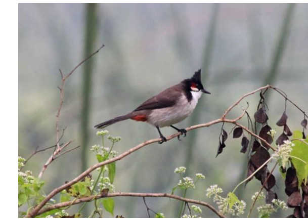
Red-whiskered Bulbul