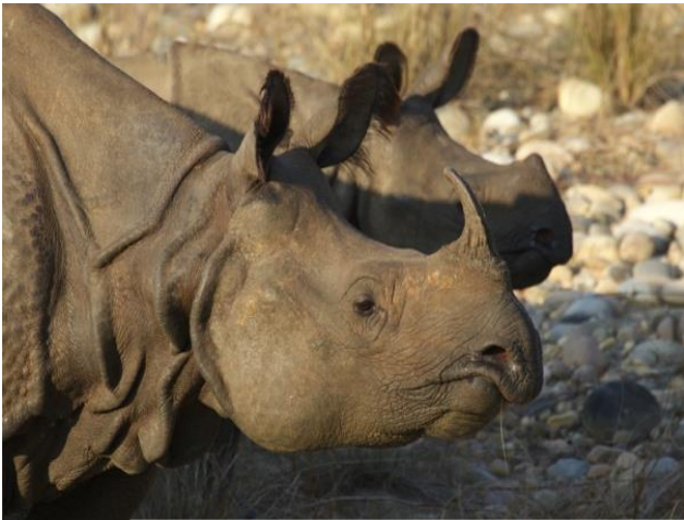
Greater One-horned Rhinoceros