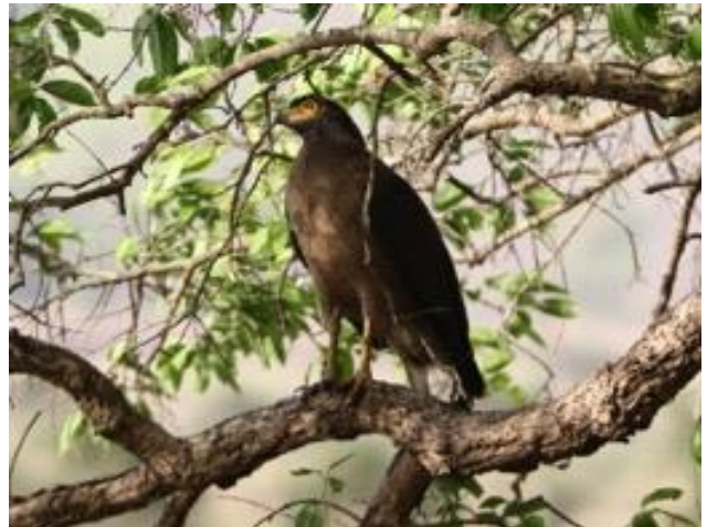
Crested Serpent Eagle