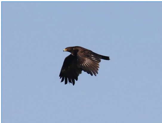
Greater Spotted Eagle