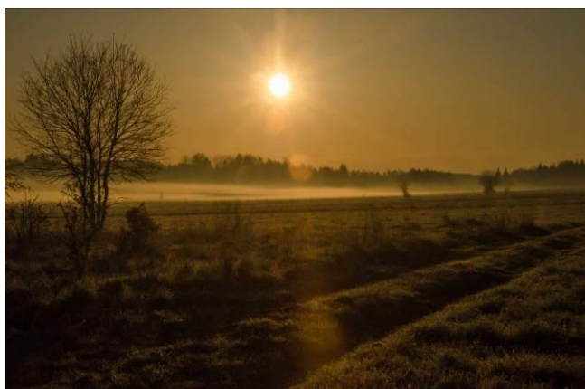
Bialowieza Meadows at sunrise