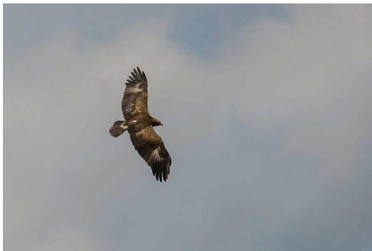
Lesser Spotted Eagle