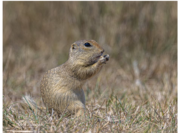
Common Souslik