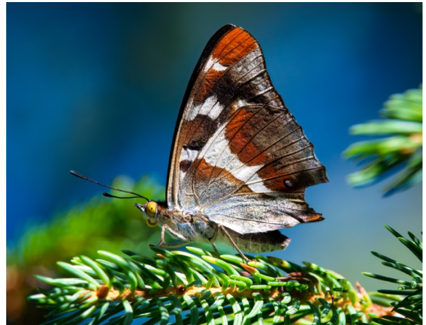
Purple Emperor