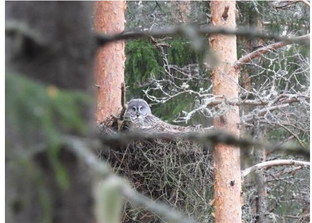
Great Grey Owl