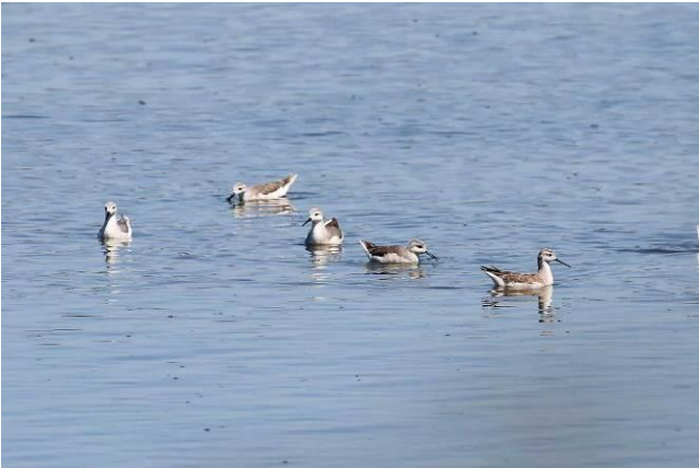
Wilson's Phalaropes at Moonglow Dairy