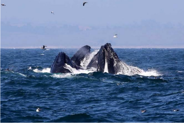
Humpback Whales lunge feeding