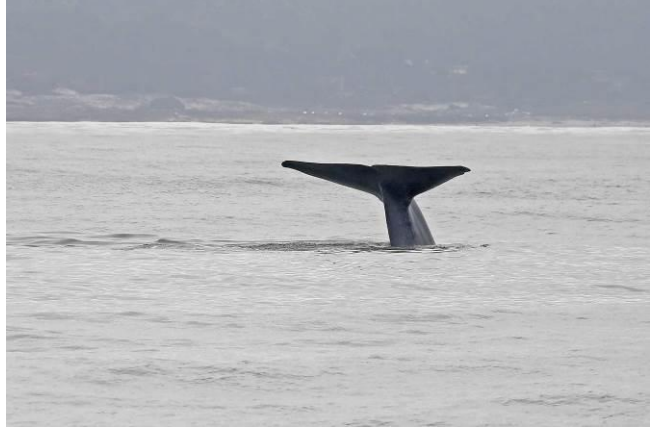
The tail fluke of a Blue Whale