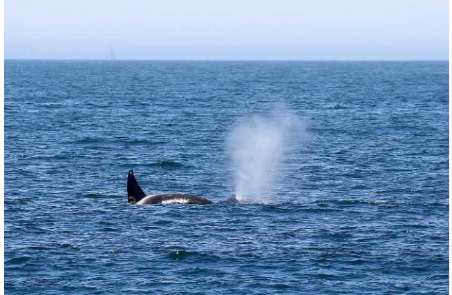
Orca & Humpback interaction