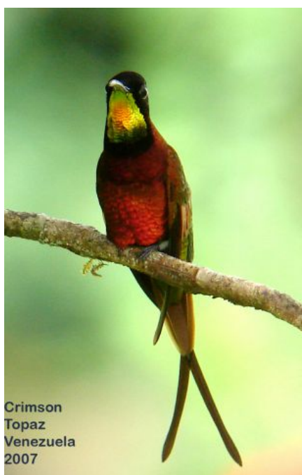
Crimson Topaz Hummingbird